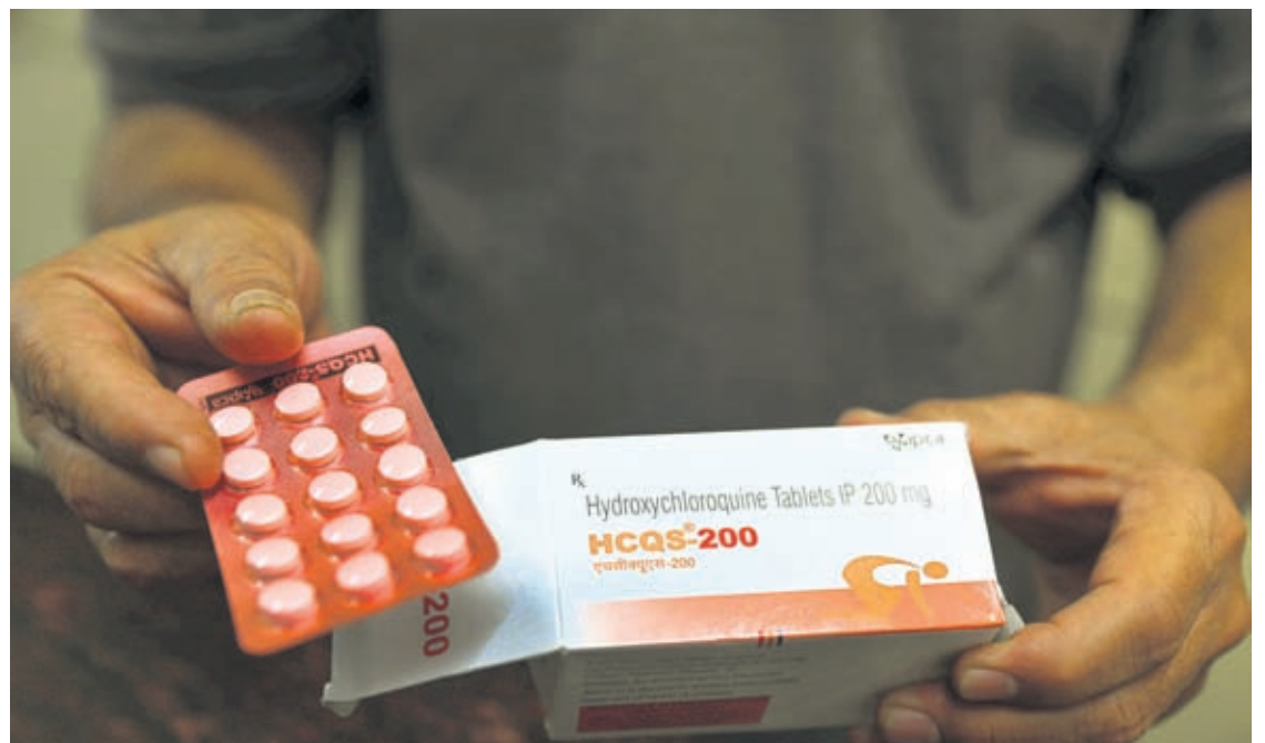
In this April 9, 2020 file photo, a chemist displays hydroxychloroquine tablets in New Delhi, India.

The decades-old drugs, also prescribed for lupus and rheumatoid arthritis, can cause heart rhythm problems, severely low blood pressure and muscle or nerve damage. The agency reported Monday that it had received nearly 390 reports of complications with the drugs, including more than 100 involving serious heart problems. Such reports represent an incomplete snapshot of complications with the drugs because many side effects go unreported.